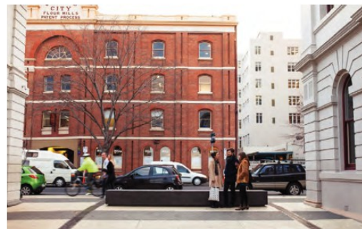
A public information session will be held this month to review the City's draft Transport Strategy.

THE City of Hobart will be holding a community and stakeholder information session this month to go over its draft Transport Strategy.